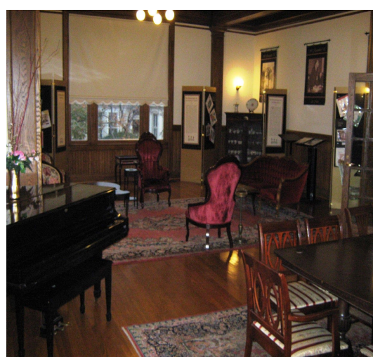
Heritage Center: Community Cultural Room