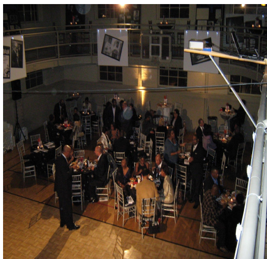
Gymnasium Dressed to the Nines: The Savoy